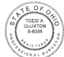
TODD A. CLUXTON, P.S. 8355

I hereby certify at the area of land located within the Hillsboro Designated Outdoor Refreshment Area to be approximately 24 acres in size.